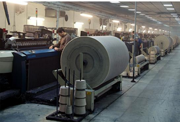
denim fabrics ludhiana, punjab, india