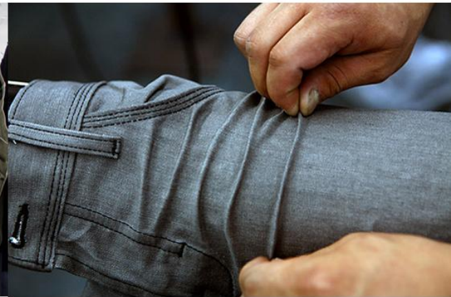
lavandria industriali emmetre, italy