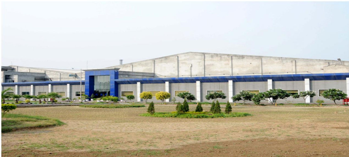
an overview of the plant