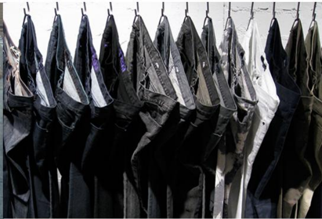
jeanswear - apparels ludhiana, punjab, india third dimension, jordan